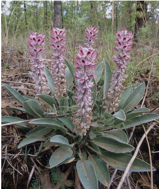
Gulf Coast Lupine

So Many Plants, So Little Time: Gulf Coast Lupine, Lupinus westianus , http://www.florida.plantatlas.usf.edu/Plant.aspx?id=1078 , a threatened plant as seen in back of Deane Bozeman School during the District Merit Badge Univ. in March.