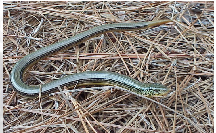
E. Glass Lizard (note where tail has grown back)

The Sky Tells a Story: Corvus the Crow http://www.rasnz.org.nz/Stars/Corvus.htm#chart http://constellationsofwords.com/Constellations/Corvus.html