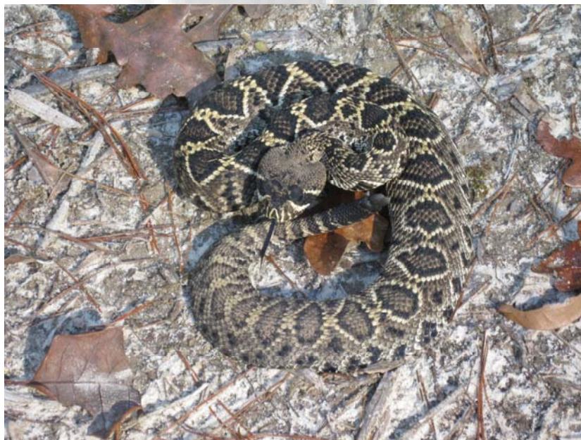
This Young Pup found at STSR Tiger Growl 6 March near Pathfinder Area