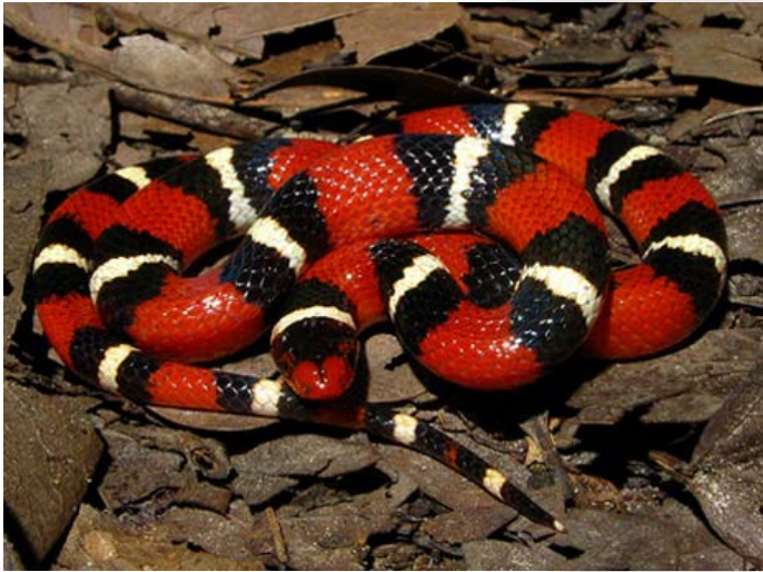
Scarlet King Snake