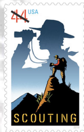
Issued 27 July 2010