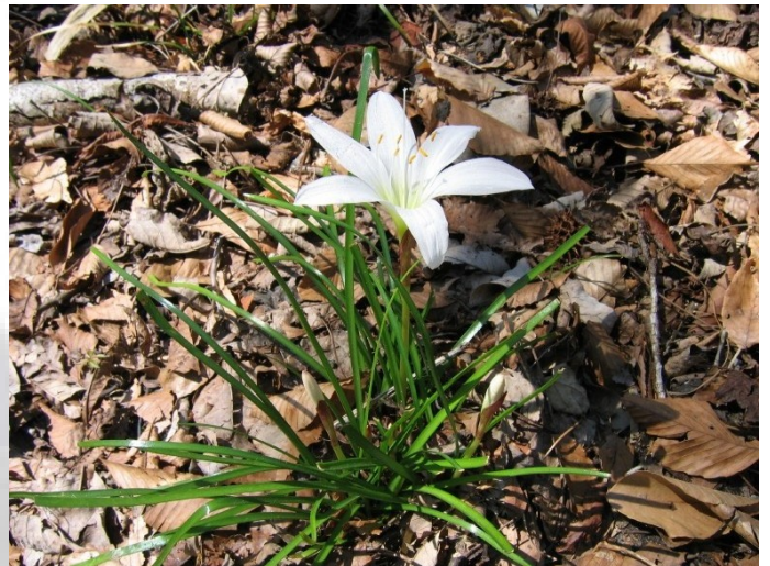
Rainlily (Torreya St. Pk.)