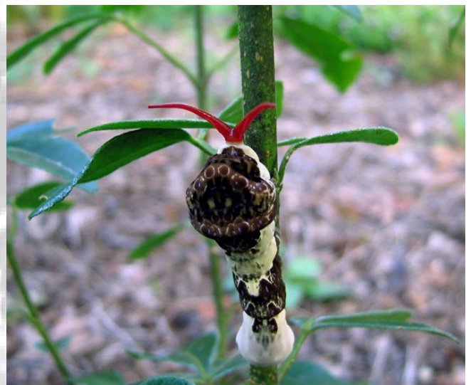
Orange Dog Caterpillar of Giant Swallowtail