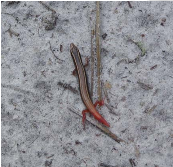
Mole Skink (note red tail)