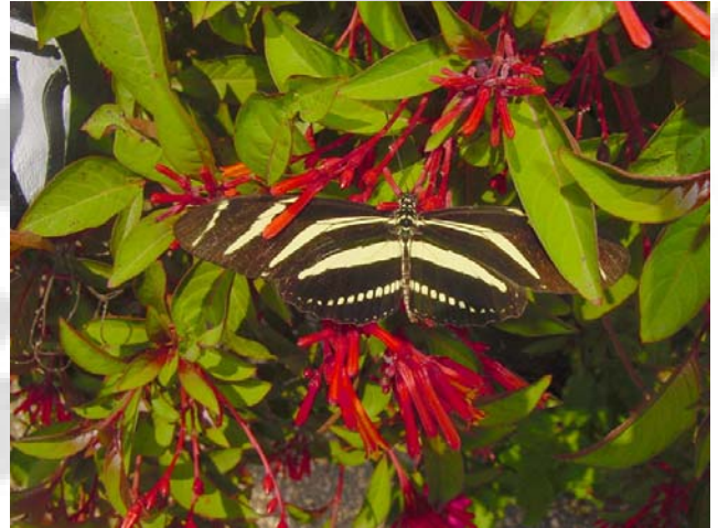
Zebra Longwing on Fire Bush

Critter of the Month: Mole Skink , Eumeces egregius , http://www.uga.edu/srelherp/lizards/eumegr.htm