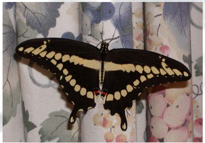
GIANT SWALLOWTAIL