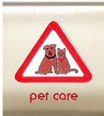
PET CARE BELT LOOP